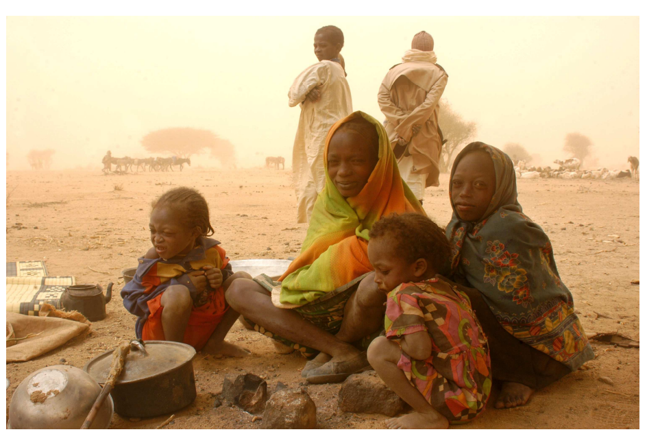
Young Sudanese refugees in the sand storm in Bamina, Chad. It is predicted that millions of people will migrate as a response to climate change.

This report was funded by the Department for International Development (DFID). The views expressed by the authors are not necessarily those of DFID.